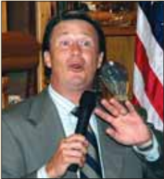
Delegate speaks of budget deficit PAGE 3